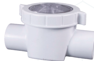
NEW Corrosion Resistant White PVC