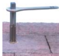
1. Insert tap in pop-up shell to create threads (For threaded shell proceed to 2)