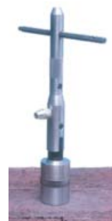
4. Place tool on castle nut and turn clockwise to remove anchor