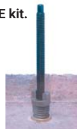
3. Thread stud in adapter 1/4"