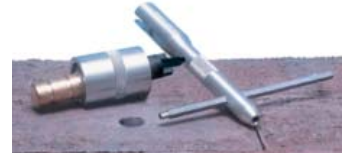
6. Place square tip of stud into tool to remove old anchor from extractor.