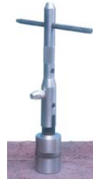
5. Attach tool. Turn clockwise to remove anchor.