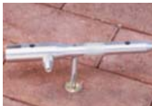
1. Thread anchor with tap