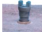
2. Thread adapter into shell