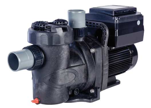
BADU Pro-III UVS