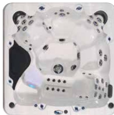
Premium Plus Madrid 60 91 x 91 x 36" Lounge. Seats up to 6.