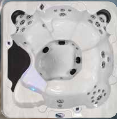
Premium Madrid 44 91 x 91 x 36" Lounge. Seats up to 6.