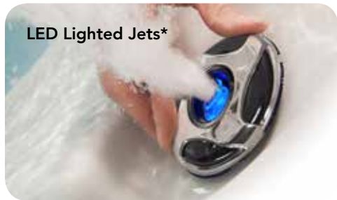
LED Lighted Jets*