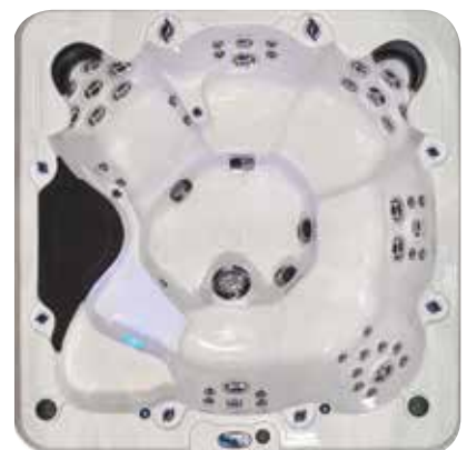
Premium Plus Vienna 60 91 x 91 x 36" Non-Lounge. Seats up to 7.