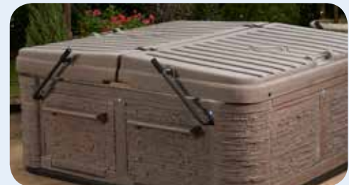
DURA-SHIELD HardCover with UltraStrong CoverLift